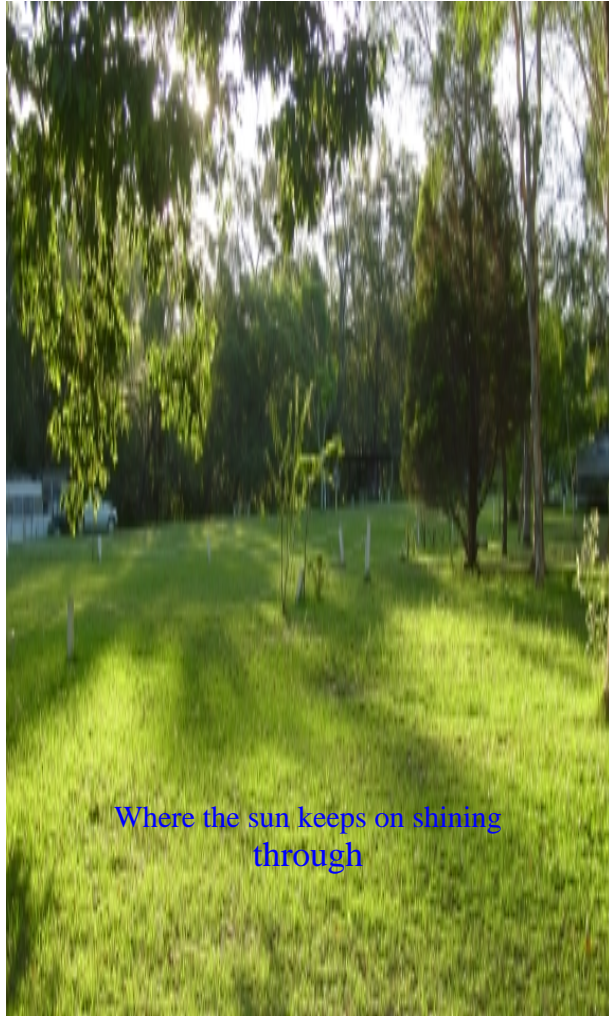
Where the sun keeps on shining through

The appropriate discovery lifestyle for the whole family